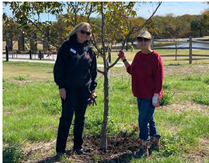
Volunteering at Josey Ranch Pocket Prairie