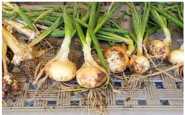
Garlic (l.) and Onions (r.)

If planning to store your garlic, you need to cure it. That means letting the bulbs dry out completely by separating bulbs from each other and placing them on a raised surface in indirect light. Be sure they have room to breathe. Then store in a cool, dry location.