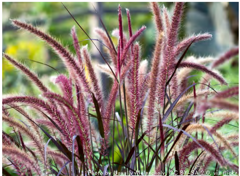
Purple Fountain Grass

Texas autumn has arrived but the lack of rain in late summer really curtailed our color show this year. If you planned for fall color in your garden that did not depend on trees or shrubs or the ubiquitous chrysanthemums for color, then you may have included Purple Fountain Grass or Pennisetum setaceum 'Rubrum'. If you haven't included this lovely, upright ornamental grass in your landscape, you really should consider adding it! Purple Fountain Grass features reddish-purplish-burgundy arching foliage with pinkish-purple seed heads that follow the breezes in summer until the frosts of fall. Purple Fountain Grass is a clumping grass that can reach three to five feet tall and two to four feet wide under ideal growing conditions, so these graceful lovelies need a little elbow room – elbow room! (It's my favorite German word and I've been trying to figure out how to fit it into an article! Bet won!) Elegant seed heads can reach another one to feet above the foliage for a very dramatic accent! They can be cut and dried to add to your fall and winter wreaths and arrangements – bonus!