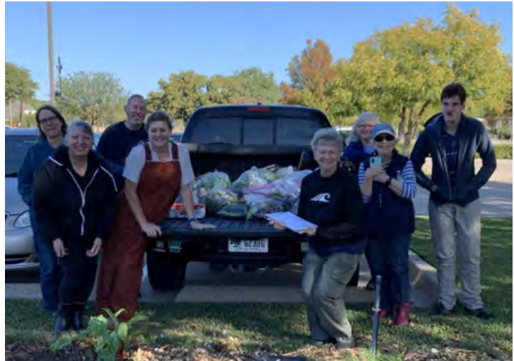
Weekly Fall Harvest Ready to Deliver

Temperatures from 26–31 degrees may damage foliage on broccoli, cauliflower, chard, lettuce, mustard, radishes, and turnips, but the plants can recover. Be sure to protect these if a hard freeze is predicted, along with any very young seedlings or new plantings such as strawberries. Pea plants are fairly cold tolerant, but may be damaged or drop blooms. A hard freeze usually won't occur in November, but in Texas, you never know!