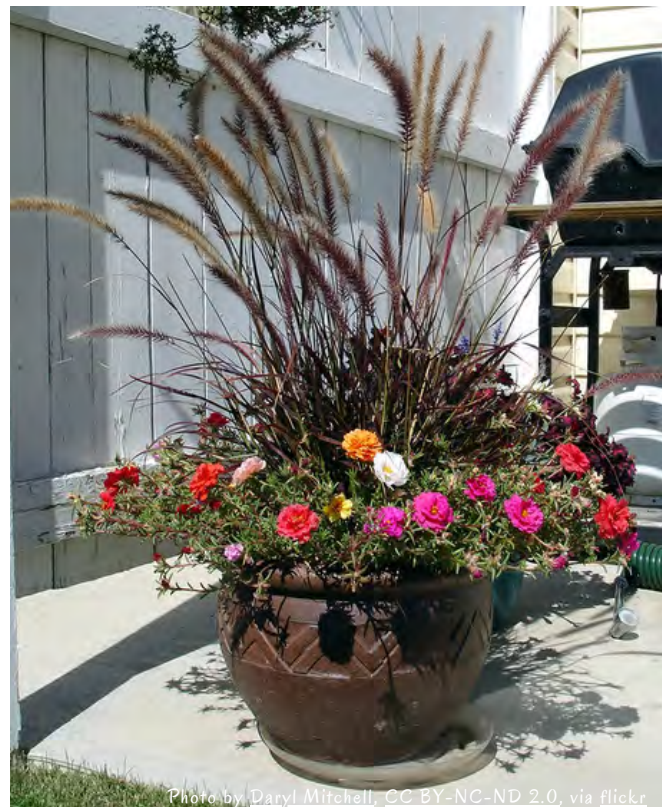
Purple Fountain Grass with Portulaca (Moss Rose)

other large-leaved plants. Their "spikiness" makes a pretty backdrop to shorter plants with rounded or lance-shaped leaves or variegated-leaved plants. Variety is the spice of life! Oooh – maybe plant some interesting Mediterranean-type herbs with them!! Locate Pennisetum setaceum 'Rubrum' where it would be backlit by the rising or setting sun to really show off the delicate foliage and seed heads – now there's a "Wow!" moment!