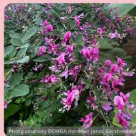
Volcano Bush Clover Lespedeza thunbergii subsp. thunbergii