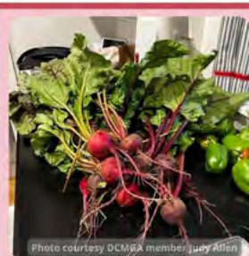
Beet Beta vulgaris subsp. vulgaris