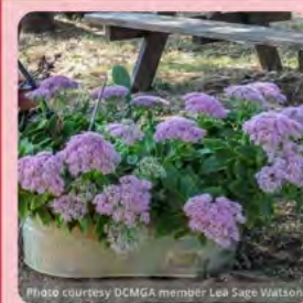
Sedum 'Autumn Joy' Hylotelephium spectabile