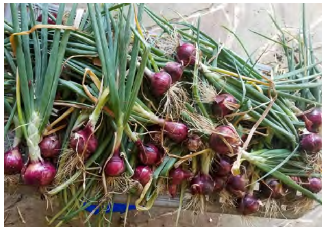
Red Onion Harvest