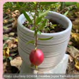
Pomegranate Punica granatum